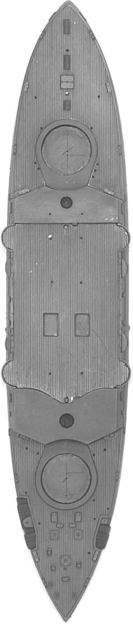
СХЕМА СБОРКИ МОДЕЛИ ASSEMBLY INSTRUCTION